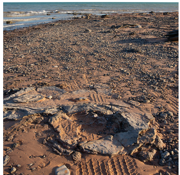
Vehicles have driven over fragile dinosaur tracks.