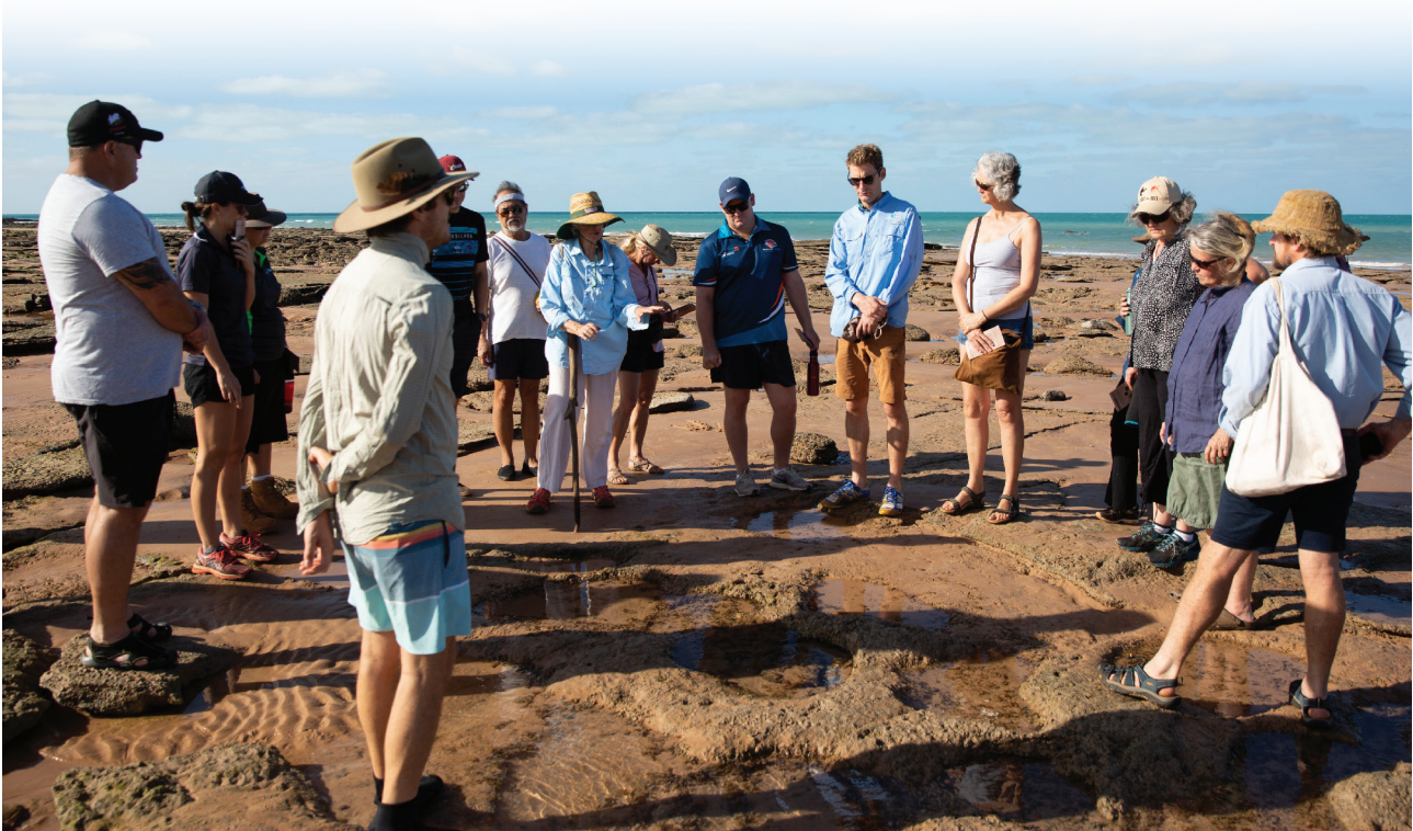
Shire of Broome Councillors and staff with DCMG at Reddell Beach.

The DCNHMP sets out the steering group’s proposed actions and goals to protect the dinosaur tracks.