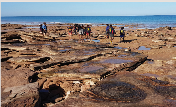
Wangkatjunga Remote Community School have gone tracking.

The dinosaur tracks, which used to be little known, have now been closely studied by palaeontologists from the University of Queensland. Partly as a result of this work, the tracks have also been much publicised in recent years, attracting more and more visitors and tourists hoping to see them. The DCMG members want to inform visitors about the significance of the tracks, their importance to local Aboriginal people, and their fragility, as well as facilitating self-guided and guided tours to accessible tracks and trackways. They also have longer-term plans to build a palaeontology interpretive centre-cum-research laboratory, for use by the public, schools and scientists.