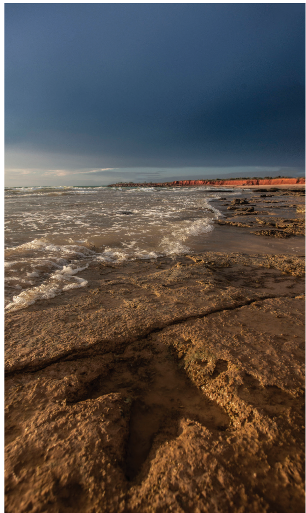
Theropod track, Reddell Beach.

Under the NHL guidelines, the Plan should be reviewed every five years, giving those responsible opportunities to review and modify or refine the Actions.