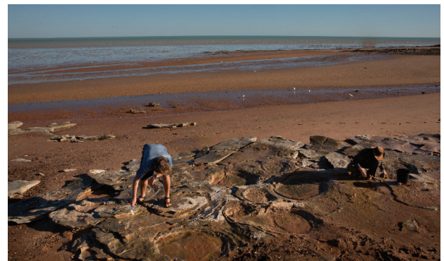
UQ researchers examine sauropod trackways.

Besides dinosaur tracks, the Broome Sandstone bears ichnofossils of other classes of animals, invertebrates and plants, as well as ancient geological formations, making it the major landform on the Dampier Peninsula with National Heritage values.